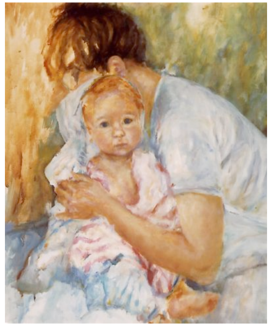
Mother with child, oil on canvas, 70 x 60 cm 1999