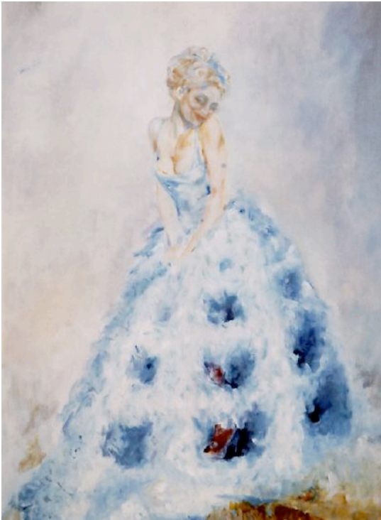
Dress of feathers, oil on canvas, 109 x 81 cm, 2000

From the very beginning my artistic development has been much influenced by the period of Impressionism and Expressionism of the early 20 th century (Fin de Siècle). Its bright range of colours and its vibrating dynamic have always been an important inspiration for me.