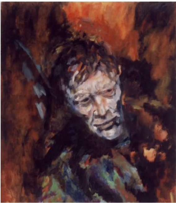
Face, oil on canvas, 80 x 60 cm, 2003