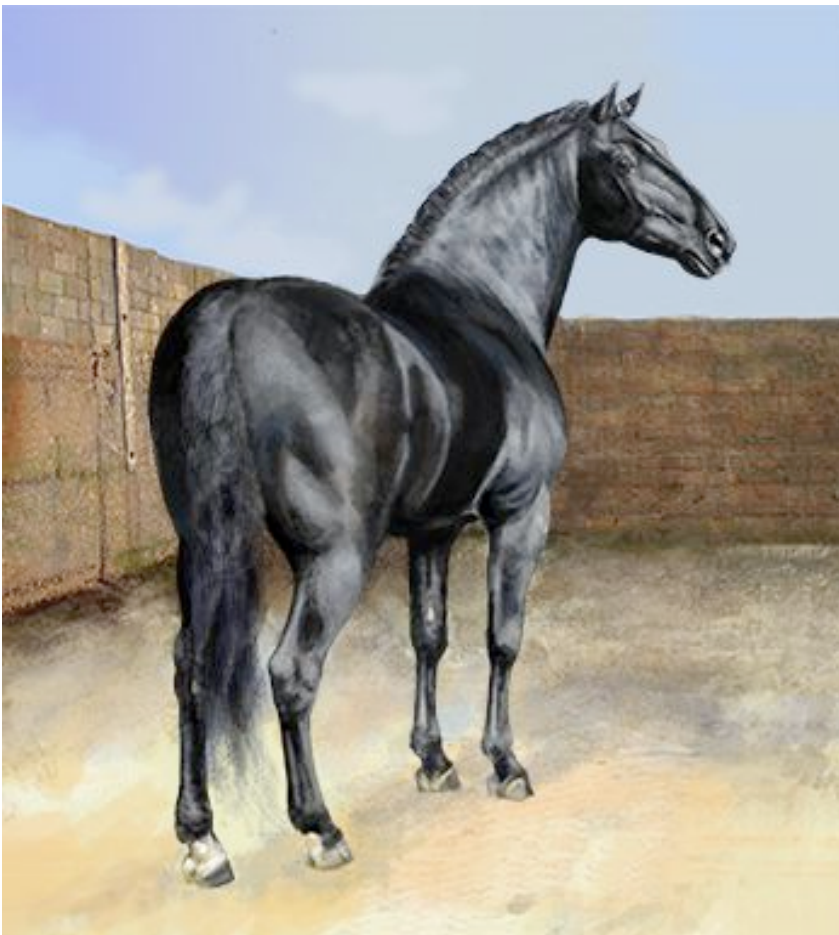
Extremeno, Computerillustration, 2011

If you have any questions or need some information, please do not hesitate to contact me.